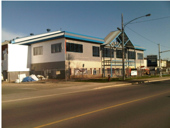
Welland Arena Renovation