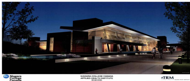
Niagara College, Welland Campus