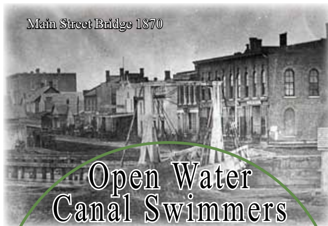
Main Street Bridge 1870

Variety Nites in "The Theatre" Welland Community Wellness Complex see pg. 80